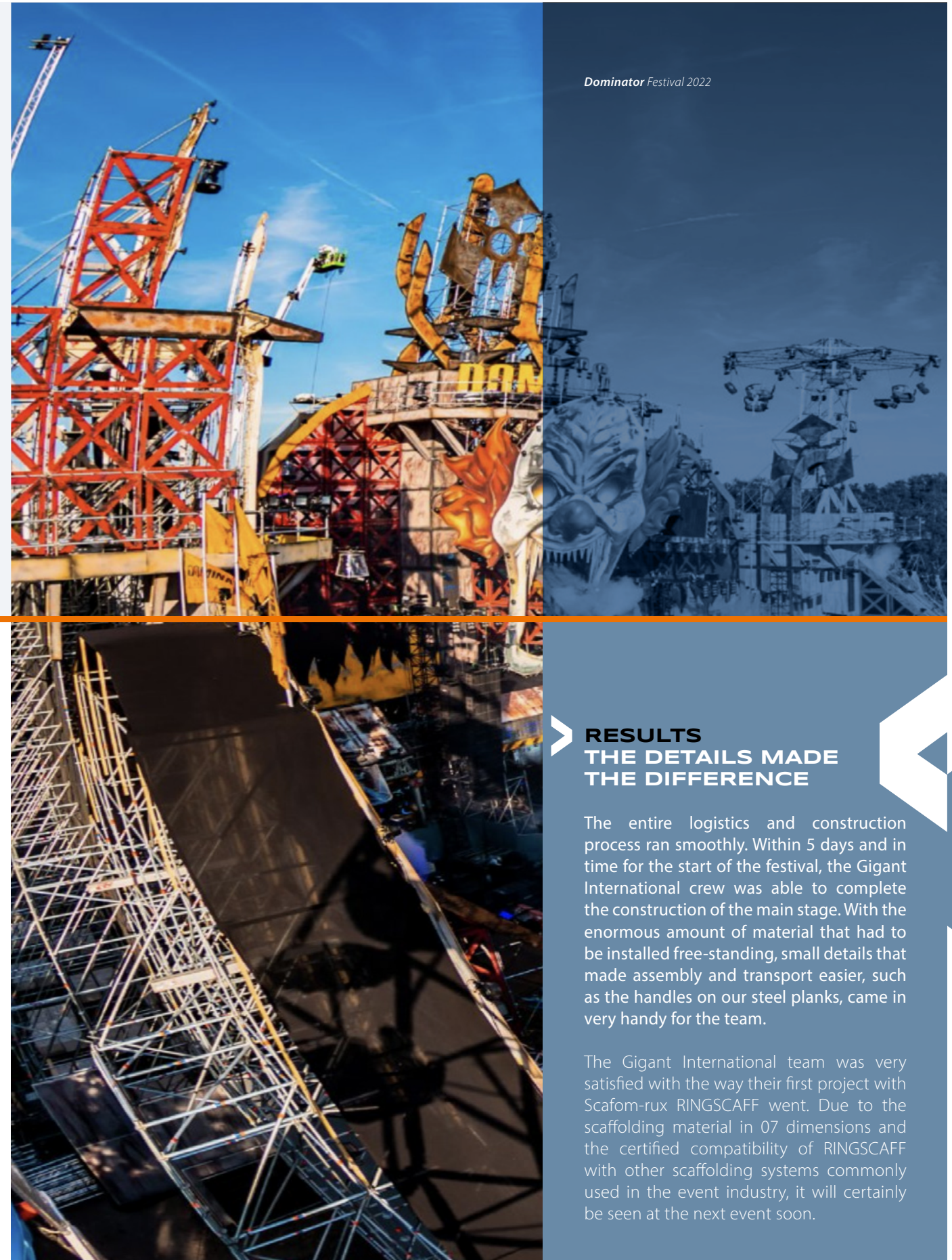
Dominator Festival 2022

The fact that the scaffolding was intended for a festival also had an impact on the planning. Thus, a structural engineer prepared drawings and calculations of the free-standing structure in advance to meet the requirements.